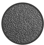
PHOTOENGRAVED [NOVATEX 7381] ADAPTER