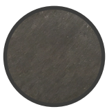
BLACK PLASTIC UPHOLSTERY PLATE