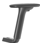
TYPE-N ARMREST INTERFACE CONNECTION ONLY