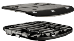
DONATI QUICK CONNECTION SLIDING SEAT FAMILY