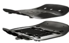
DONATI BOLT-ON SLIDING OR FIXED SEAT FAMILY