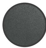
TRAFFIC GREY (RAL 7043) PLASTIC SIDE KNOB