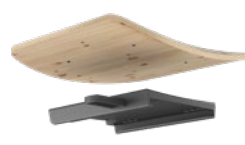
DONATI QUICK CONNECTION SLIDING ADAPTER PLATE CODE: 4515220