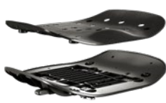
DONATI BOLT-ON SLIDING OR FIXED SEAT FAMILY