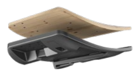
DONATI QUICK CONNECTION SLIDING ADAPTER MODULA 1 CODE: 4515270