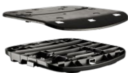
DONATI QUICK CONNECTION SLIDING SEAT FAMILY