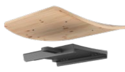
DONATI QUICK CONNECTION SLIDING ADAPTER PLATE CODE: 4515220