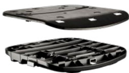
DONATI QUICK CONNECTION SLIDING SEAT FAMILY