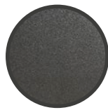
BLACK PLASTIC LEVERS, SEAT PLATE, COVER, SIDE KNOBS