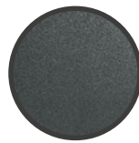
TRAFFIC GREY (RAL 7043) PLASTIC SIDE KNOB