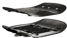
DONATI BOLT-ON SLIDING OR FIXED SEAT FAMILY