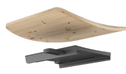
DONATI QUICK CONNECTION SLIDING ADAPTER PLATE CODE: 4515220