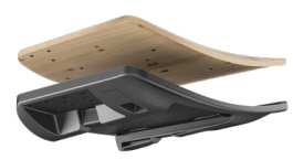
DONATI QUICK CONNECTION SLIDING ADAPTER MODULA 1 CODE: 4515270