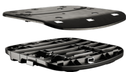
DONATI QUICK CONNECTION SLIDING SEAT FAMILY