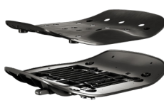
DONATI BOLT-ON SLIDING OR FIXED SEAT FAMILY