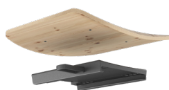
DONATI QUICK CONNECTION SLIDING ADAPTER PLATE CODE: 4515220