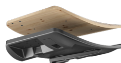
DONATI QUICK CONNECTION SLIDING ADAPTER MODULA 1 CODE: 4515270