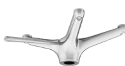
SUPERLEGGERO SWIVEL SUPPORT WITH HEIGHT ADJ. CODE: 1050620