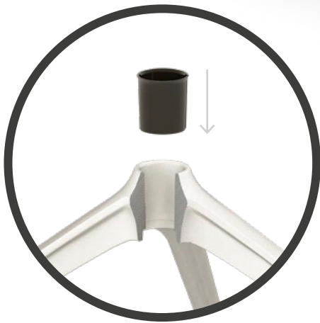
TAPERED PLASTIC BUSHING AVAILABLE IN TWO EXTERNAL DIAMETERS