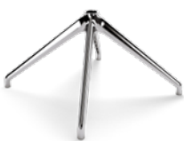
SUPERLEGGERA 4 STAR BASE — HIGH MORSE CONE Ø 44 mm CODE: 5010490