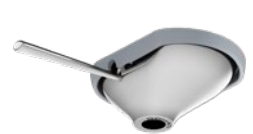
ARMONICO COLLECTION WITH HEIGHT ADJ.