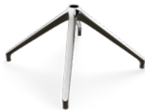
UNICA 4 STAR BASE MORSE CONE Ø 44 mm CODE: ON REQUEST