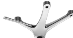
SPIDER SWIVEL SUPPORT WITH HEIGHT ADJ. CODE: 1050530