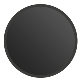
BLACK PAINTED FOOTREST