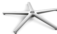
TREVI 4 AND 5 STAR BASE COLLECTION