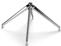
SUPERLEGGERA 4 AND 5 STAR BASE COLLECTION