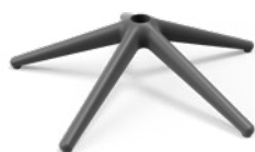
QUOIN MEDIUM (NYLON) CODE: 5012110