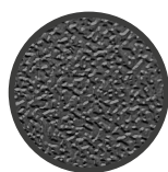
TEXTURED (NOVATEX 340)