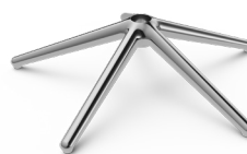
QUOIN MEDIUM (ALUMINIUM) CODE: 5010910