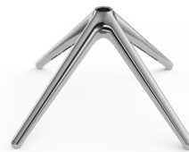
QUOIN HIGH (ALUMINIUM) CODE: 5010900