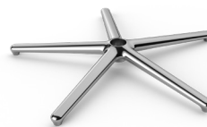
QUOIN 5 STAR ALUMINIUM & NYLON BASE COLLECTION