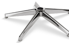
PRESTO (ALUMINIUM) CODE: 5010181