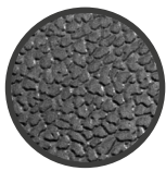
PHOTOENGRAVED (NOVATEX 140)