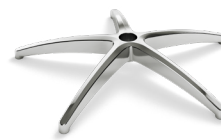
DB2.6 (ALUMINIUM) CODE: 5010270