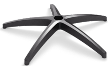
DB2.6 (NYLON) CODE: 5012015