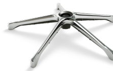
DB2.13 (ALUMINIUM) CODE: 5010715