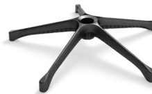
DB2.13 (NYLON) CODE: 5012040