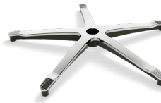
DB1.9 (ALUMINIUM) CODE: 5010290