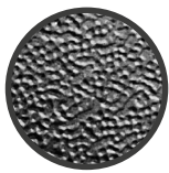
PHOTOENGRAVED (NOVATEX 716)