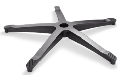
DB1.9 (NYLON) CODE: 5012035