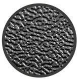
PHOTOENGRAVED (NOVATEX 136)