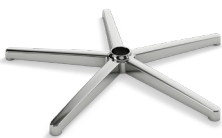
DB1.8 (ALUMINIUM) CODE: 5010280