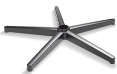
DB1.8 (NYLON) CODE: 5012030