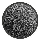
INSERTS: PHOTOENGRAVED [NOVATEX 016]