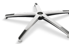
DB1.6 (ALUMINIUM) CODE: 5010247