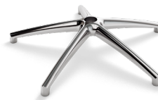
B1T (ALUMINIUM) CODE: 5010260