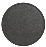
BLACK NYLON BACK BAR