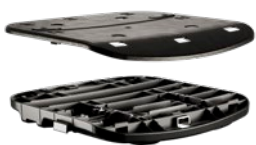
TYPE-B ARMREST INTERFACE SEATS ONLY