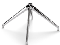
SUPERLEGGERA 4 STAR BASE — HIGH MORSE CONE Ø 40 mm CODE: 5010480