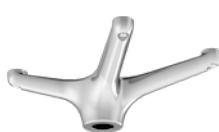
SUPERLEGGERO SWIVEL SUPPORT (W/O HEIGHT ADJ.) CODE: 1050610