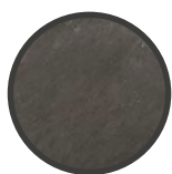
BLACK PLASTIC COLUMN